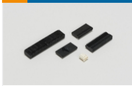
Wire-to-Board Connector Assemblies & Housings(139)