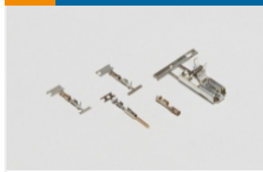
Wire-to-Board Connector Contacts(2)